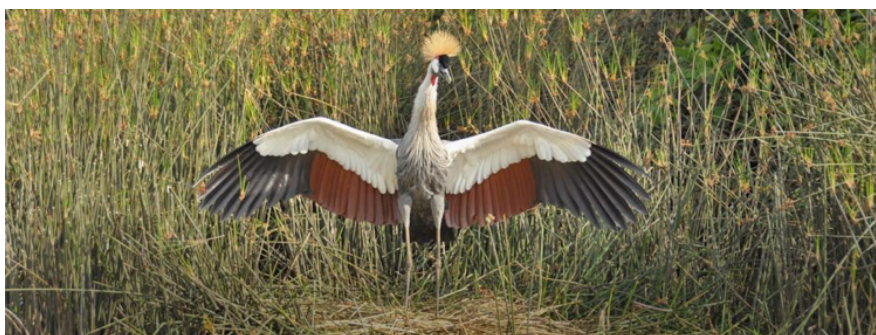
Wildlife is important to Kenyan tourism

Karibu Kenya believes strongly in preserving the environment. Partner Gamewatchers Safaris initiated the conservancy concept and led the way in establishing conservancies around Kenya, substantially extending wildlife areas to the benefit of the wildlife and the local communities. Believing that collaboration between tourism and conservation is vital, Karibu Kenya and Gamewatchers Safaris work with hotels, resorts, airlines and other tourism operators who actively implement eco-policies and sustainable tourism practises.